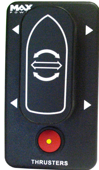
Product Ref. : 318234

The Boat Control Panel integrates all of the unique safety and technical features of the Max Power control panel range once again ensuring peace of mind onboard.